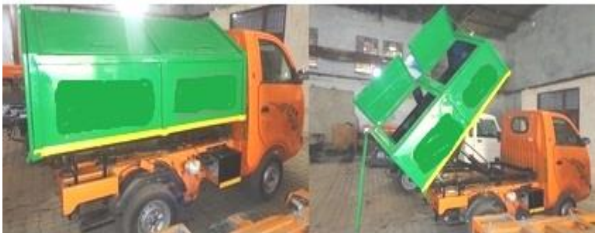
Proposed Vehicle Picture